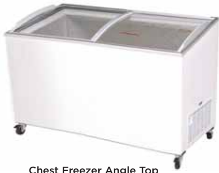
Chest Freezer Angle Top Curved Glass -5ft CF0500ATCG