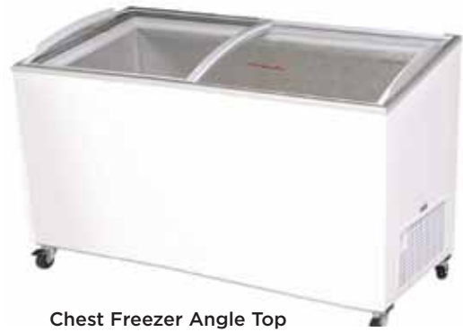
Chest Freezer Angle Top Curved Glass -6ft CF0600ATCG

The Angle Top, Curved Glass Chest Freezers offer the perfect display for ice cream and frozen food. The curved glass and angle top gives perfect visual display for impulse sales. The sides can be decal'd (charges apply -POA) 5 sizes available (176, 264, 352, 427 and 555 litre).